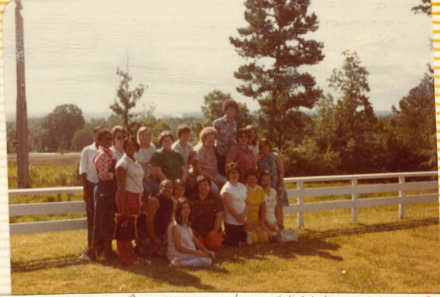
5 OUR FIRST FIELD TRIP. WE WENT TO RIVERWOOD, CLARK CO, STILLMEADOW & RETIREMENT INN - NURSING HOMES & SALINE & MALVERN HOSP 6