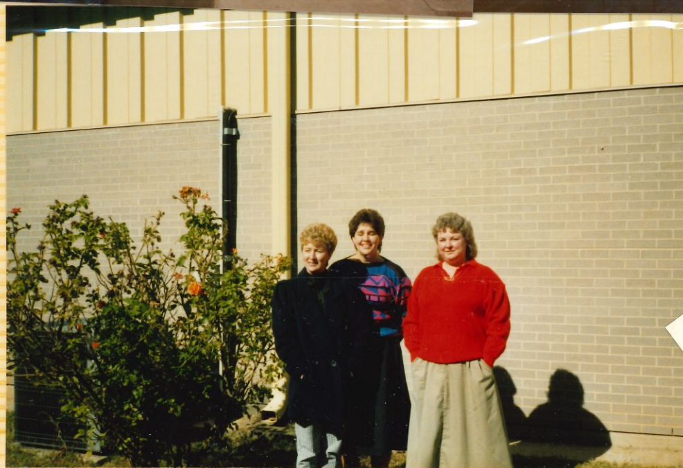
The Beaton Trio