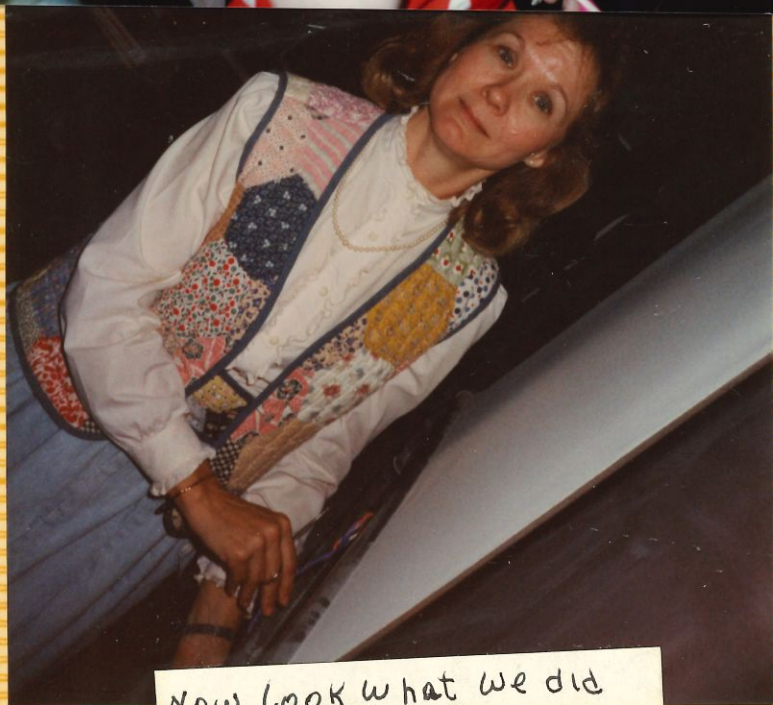
Now look what we did to our teacher