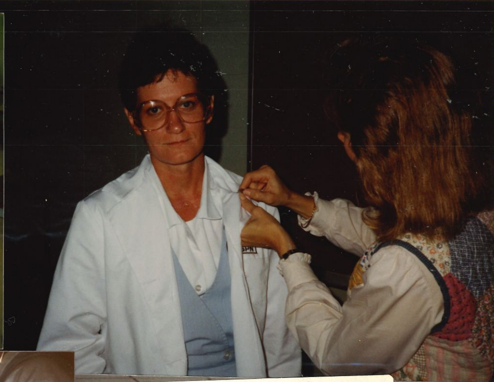
Penned or Pinned