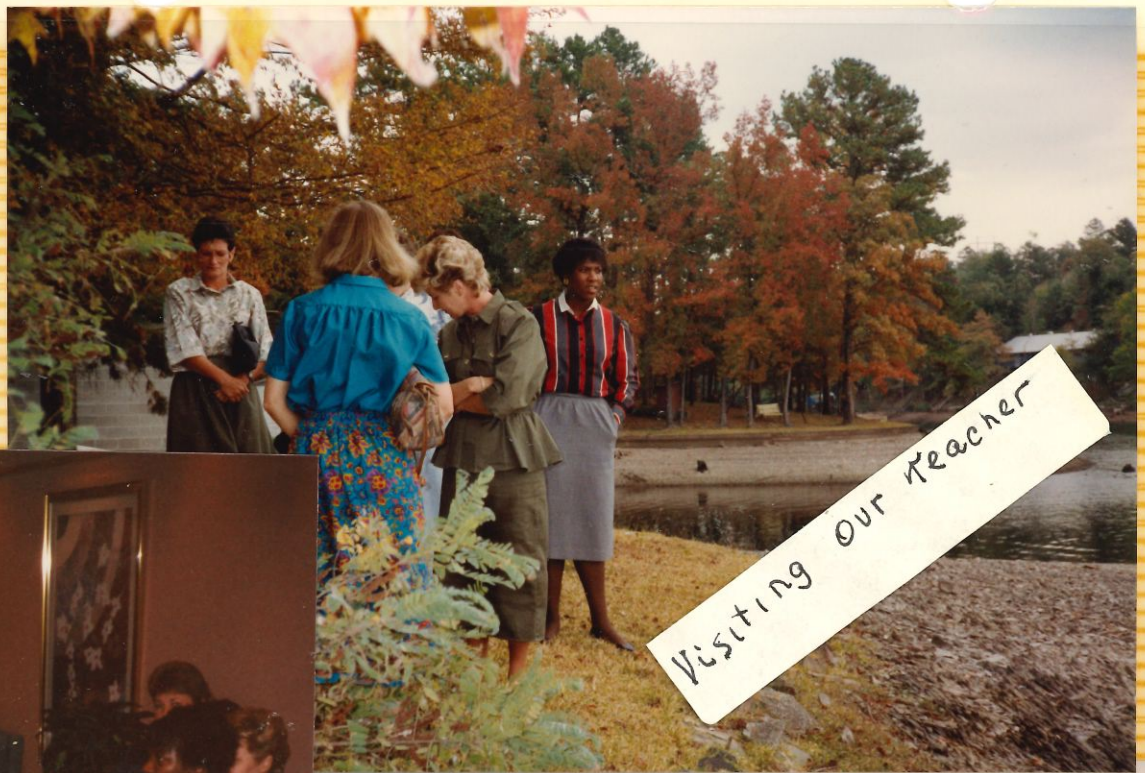
Visiting Our Teacher