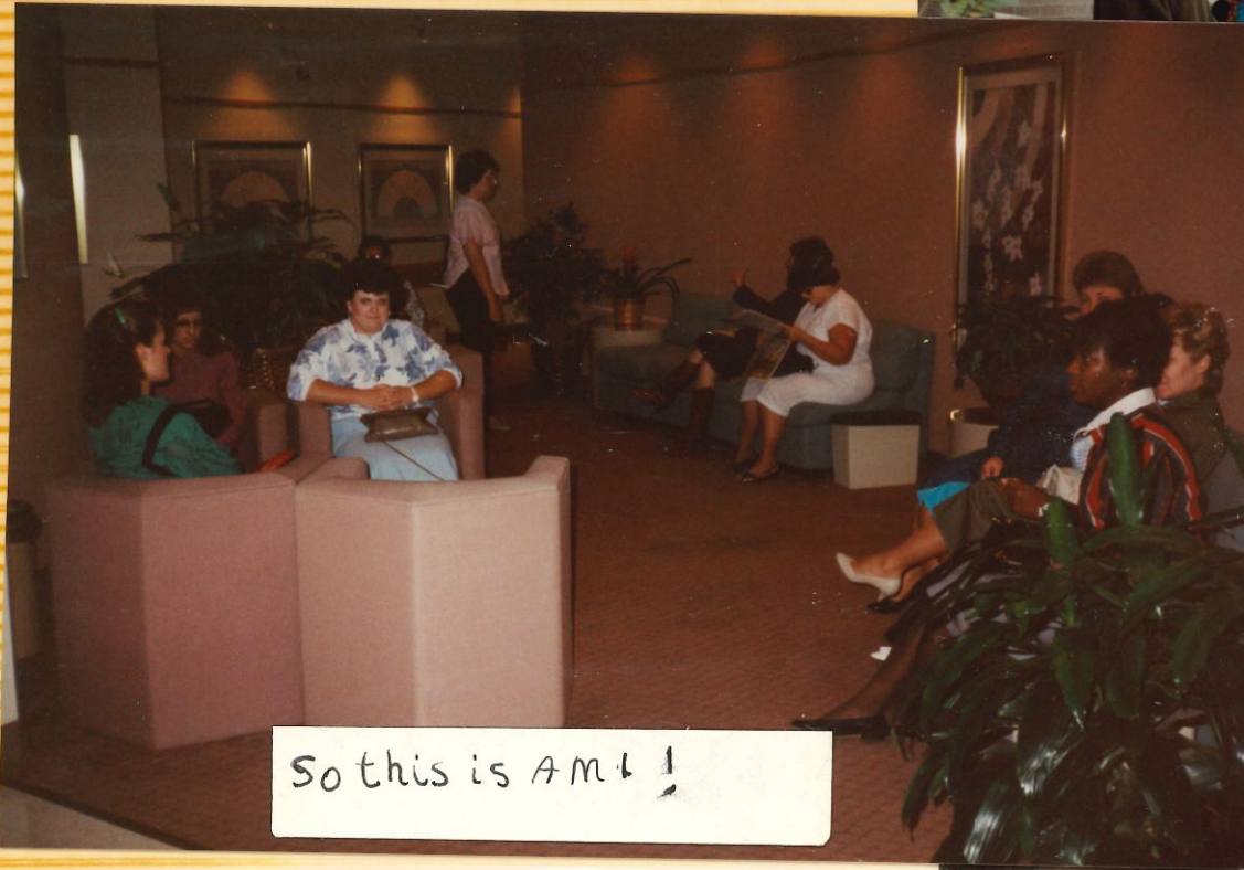
So this is AM!