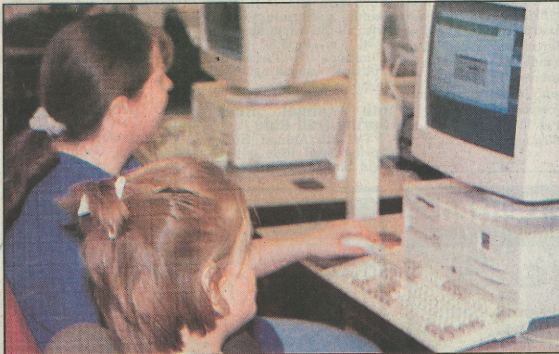
Students in OTC's VAST lab work on project Eagle Park, a community walking park the class is designing for the back of campus. VAST will have its first graduates in spring 2003.

The remaining 34 credit hours for the VAST degree at OTC are broad core courses and general education courses, which will transfer to four-year universities if students wish to seek a bachelor's degree.