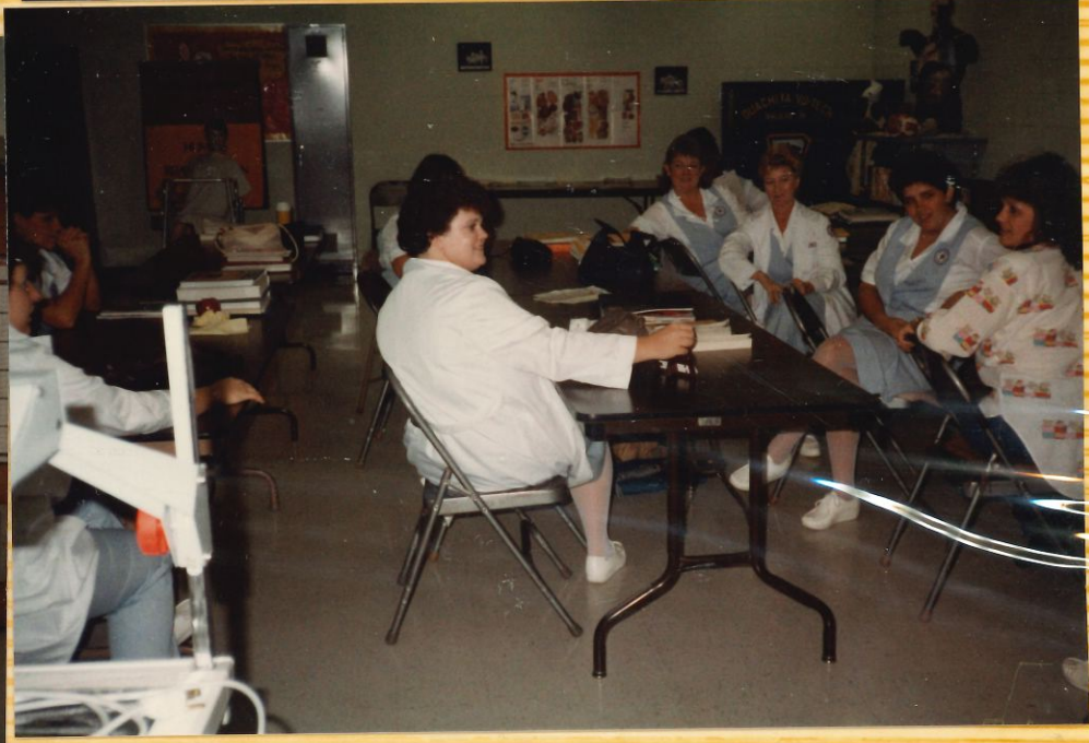
Don't ask what for Just Raise your hand