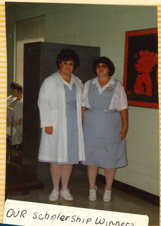
OUR scholarship winners