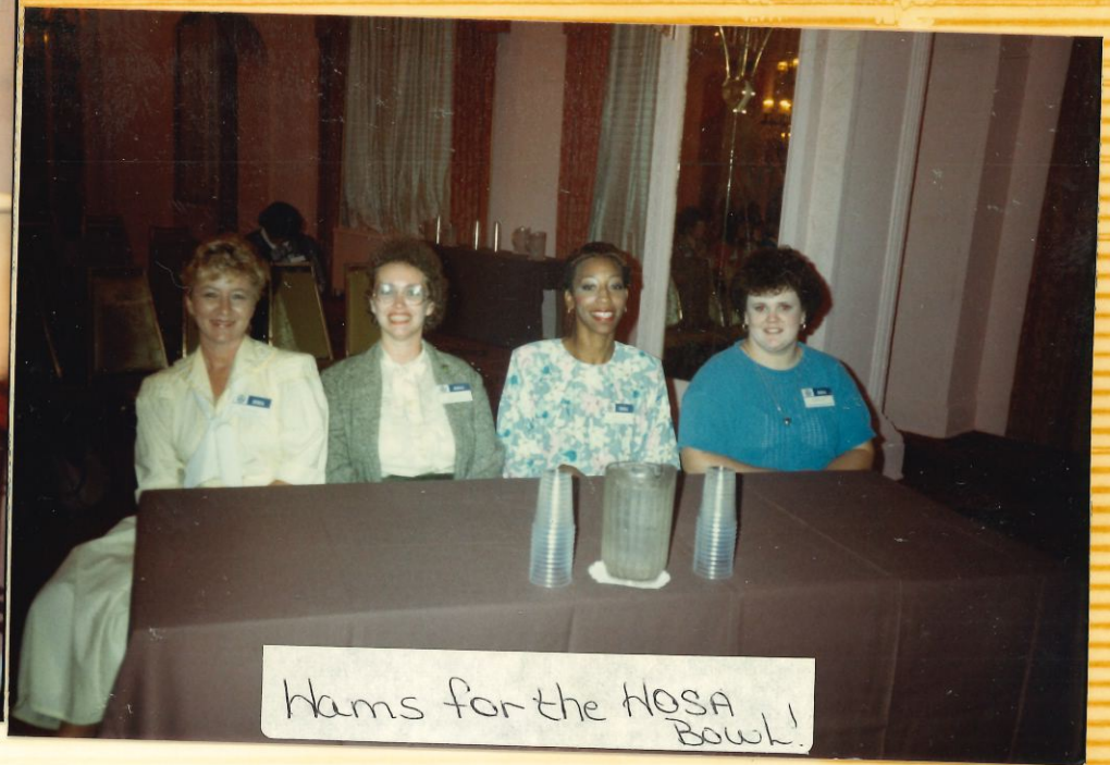
Hams for the HOSA Bowk!