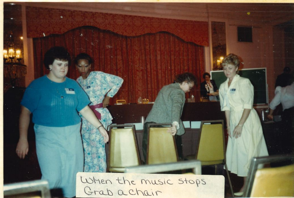
When the music stops Grab a chair