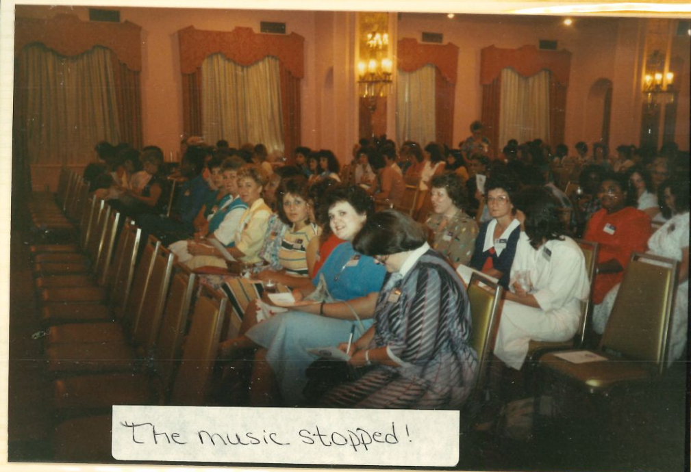
The music stopped!